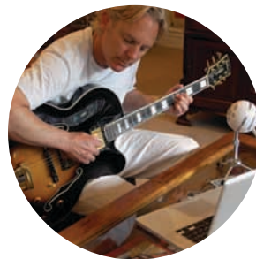
music vocals, guitars, drums, strings, brass, woodwinds